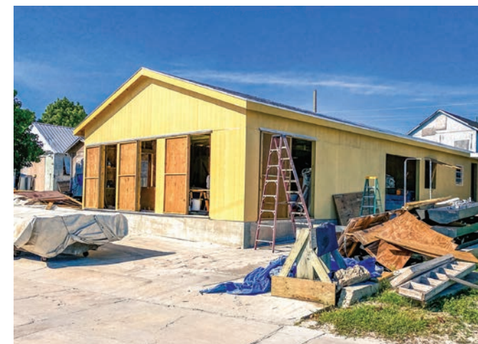
Businesses are working hard to reestablish themselves, with inns, marinas, restaurants, shops and grocery stores finally reopening their doors.