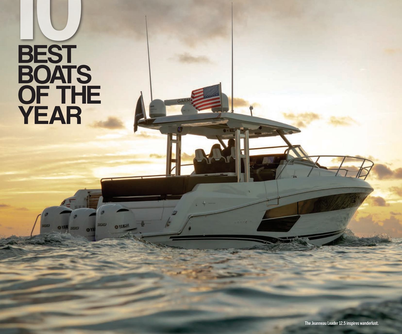
The Jeanneau Leader 12.5 inspires wanderlust.